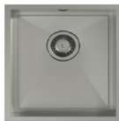
stainless steel (SS)