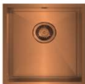
PVD copper (COP)