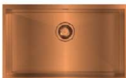
PVD copper (COP)