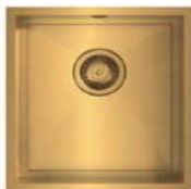
PVD gold/brass (G/B)