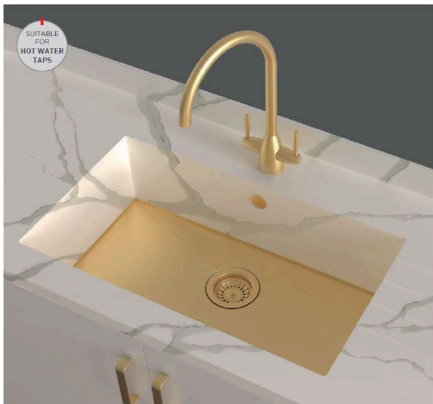
sen70 SHOWN IN GOLD/BRASS

26mm lip bowls to be used with traditional surface materials such as Corian, Quartz or Porcelain