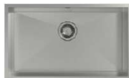
stainless steel (SS)