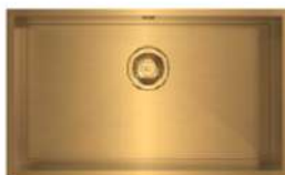
PVD gold/brass (G/B)