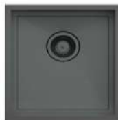
PVD gunmetal (GM)