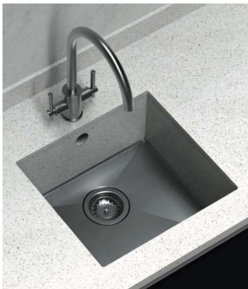
sen45 SHOWN IN GUNMETAL

26mm lip bowls to be used with traditional surface materials such as Corian, Quartz or Porcelain