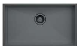
PVD gunmetal (GM)