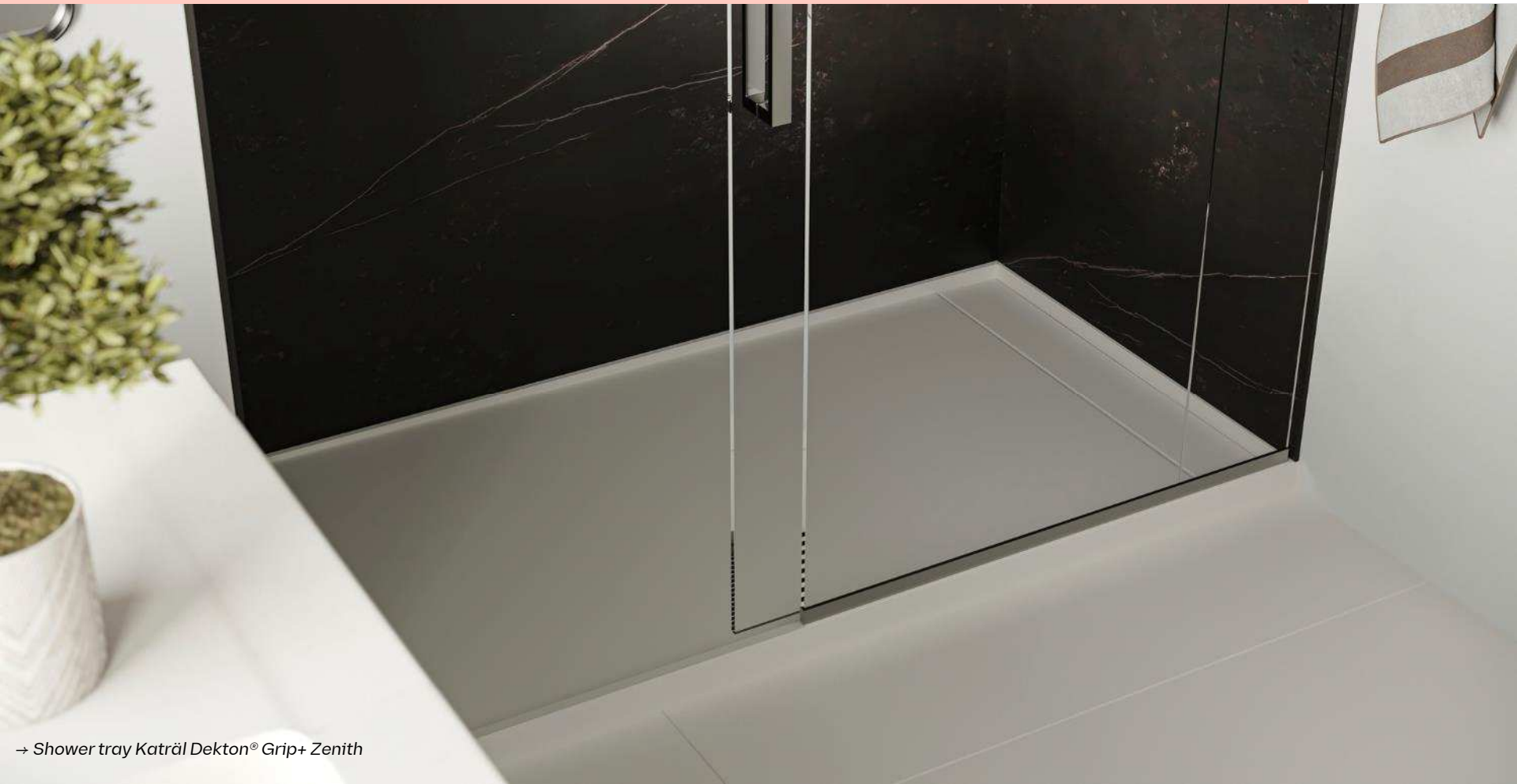
→ Shower tray Katräl Dekton® Grip+ Zenith