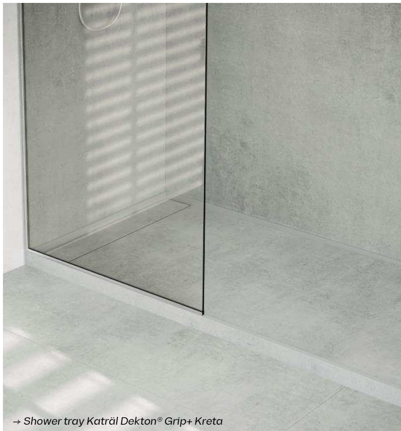
→ Shower tray Katräl Dekton® Grip+ Kreta